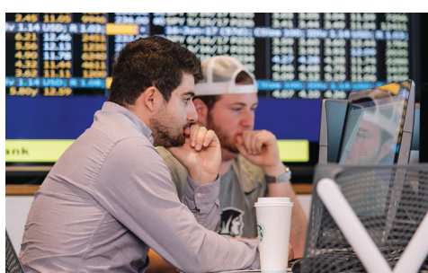
Explore Courses of Study and More